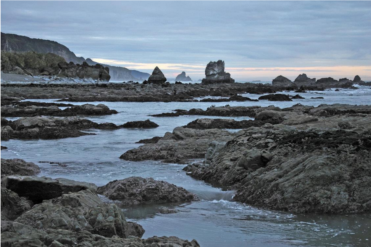
Low tide at Twelve Mile Beach near Greymouth

Some beaches offer generally much harsher conditions for plants and animals to live in than others. There tends to be many more different species in a beach with rock pools (hāroto) than on an open sandy beach. All living things found in each of the beach zones have adaptations that enable them to survive in that habitat.