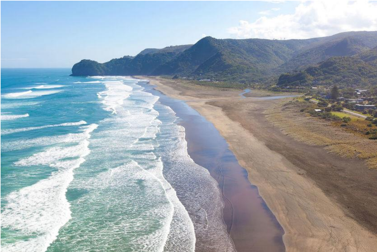
Piha Beach

There are various kinds of beaches, and the way they look is constantly changing