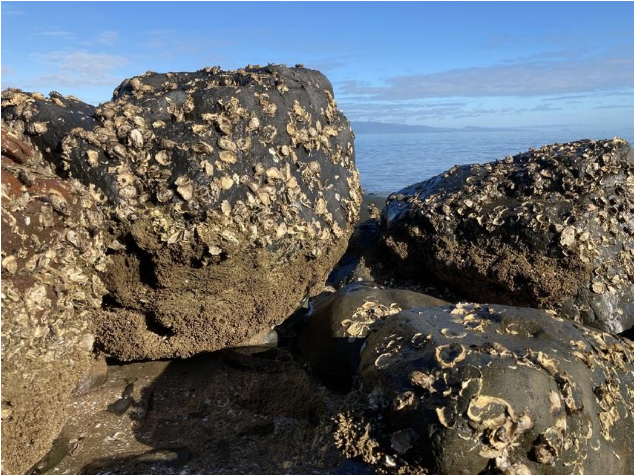
Ngarimu Bay, Anne Barker.

Every beach has a range of habitats, and different kinds of living things can be found in each habitat