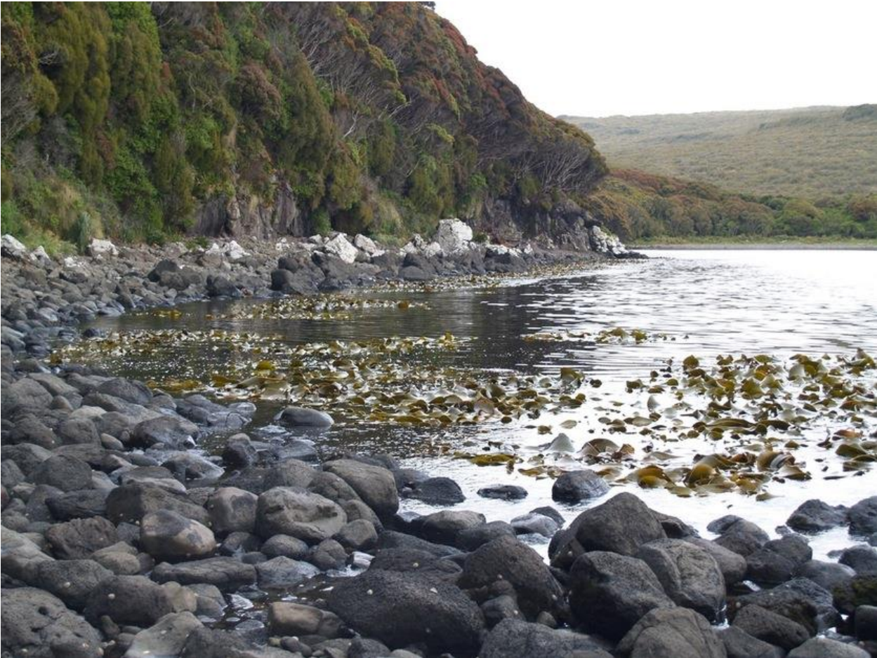
Intertidal zone, Auckland Island, Dr Rebecca McLeod

All the living things that make their homes at the beach rely on that environment for their basic needs – food and shelter.