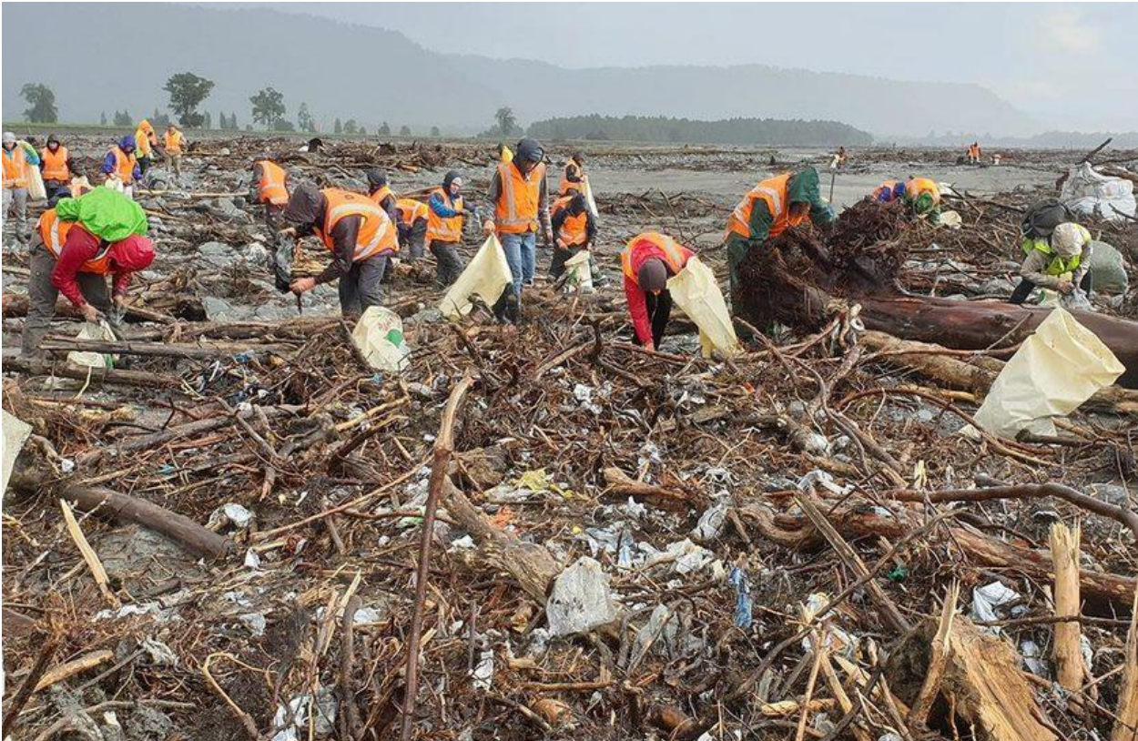
Pollution from the Fox Glacier landfill being washed down the Fox River and along the coast, DOC, CC BY 4.0 .

The beach environment undergoes not only the diverse regular daily and seasonal changes of conditions but also the unpredictable changes due to extreme weather, unusual tides and the impact of people.