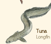
Tuna Longfin eel