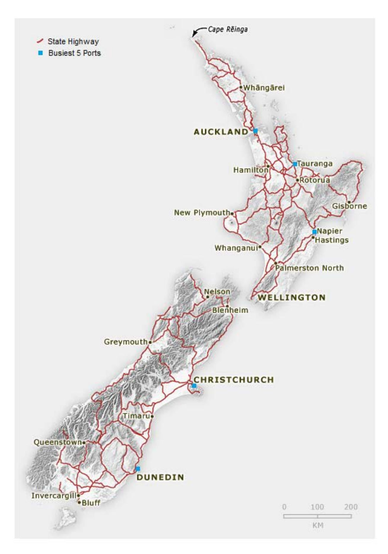
https://teara.govt.nz/en/map/23325/state-highway-network, adapted to include the five busiest ports.