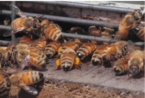
University of Waikato