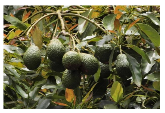
University of Waikato