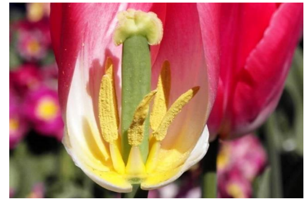
University of Waikato