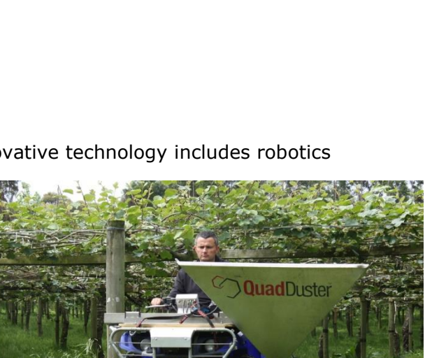
University of Waikato

• Investigating pollen processing using evidence