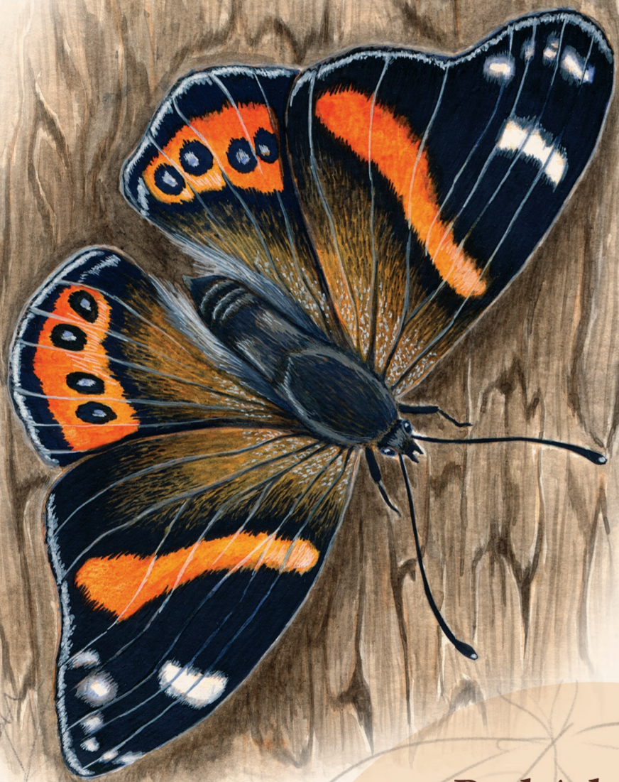
Red Admiral Vanessa gonerilla

A lot of native insects evolved to live on native plants. Species like the red admiral butterfly ( Vanessa gonerilla ) depend on the native stinging nettle ongaonga ( Urtica ferox ). Unfortunately, the native stinging nettle isn’t very popular in cities because of its poisonous sting. Because of this, it is very rare to see admiral butterflies in urban areas. Another possible explanation for the decreased numbers of kahukura is the arrival of parasitic wasps ( Pteromalus puparum and Echthromorpha intricatoria ) that prey on this species.